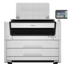
PlotWave 5000/5500 printing systems