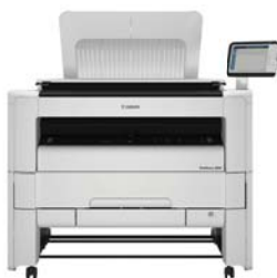
PlotWave 3000 series

Printing from many locations and sources is supported by the PlotWave series. With Publisher Mobile, you can preview and print files from your mobile phone or tablet. With Publisher Express, you can submit print files directly from the web. Driver Select, the printer driver for Windows, helps reduce errors and supports first-time-right results, with its clear and easy-to-use functionality. Driver Express enables printing PostScript files from Mac and Windows.